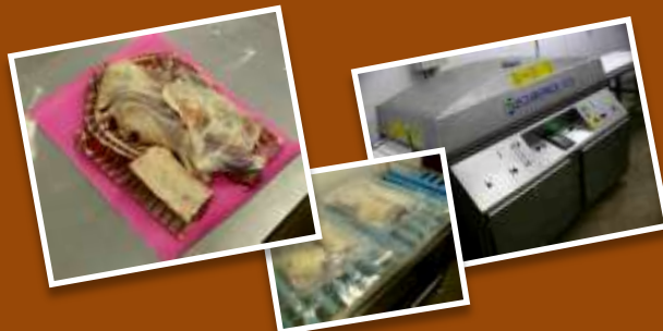
GAS FLUSH (C.A.P.TECH)